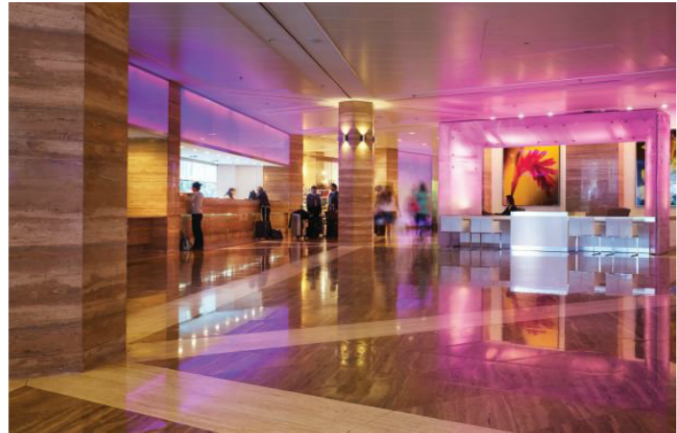
Art has a place in every corner of the hotel's lobby, from works mounted on the walls to the interactive seating pods spread throughout.

millimeters apart for high-resolution digital video displays.