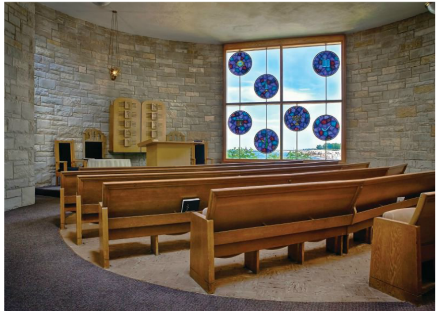
Seen from the neighboring park (top), the chapel's new aperture presents a far warmer image than the solid rock wall had in the past. Cutting open the stone wall (bottom) to create a window and showcase the donated stained glass panels gave the chapel a brighter aspect.